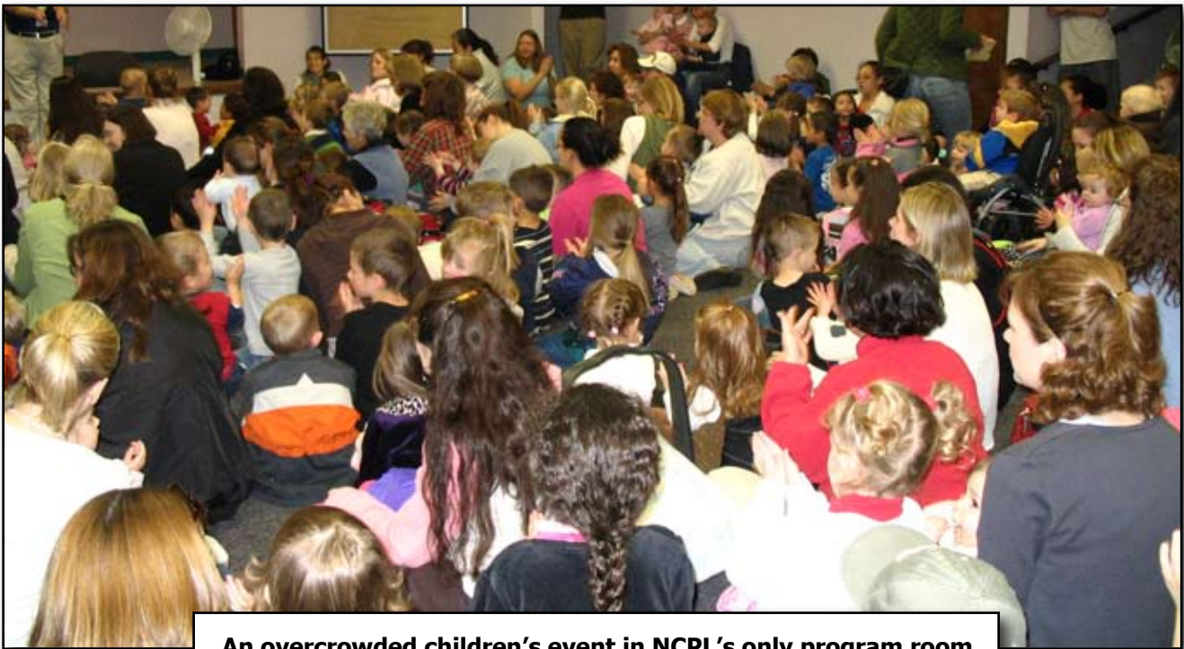
An overcrowded children's event in NCPL's only program room