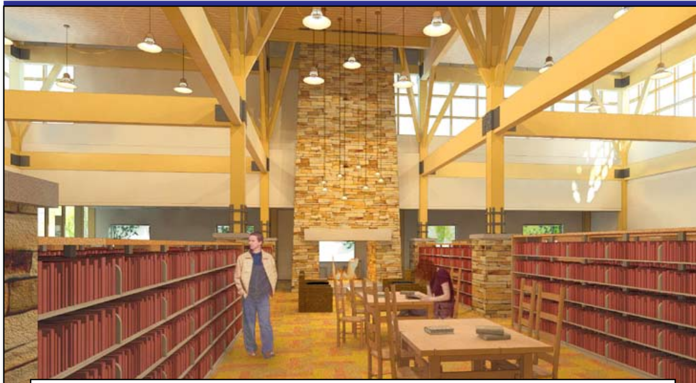
These preliminary renderings of the new library's interior show the abundance of natural light.