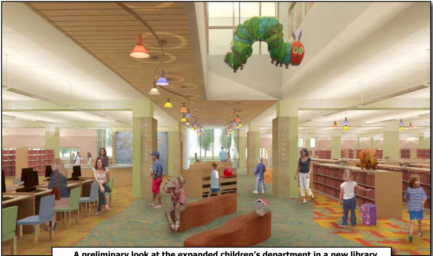
A preliminary look at the expanded children's department in a new library.