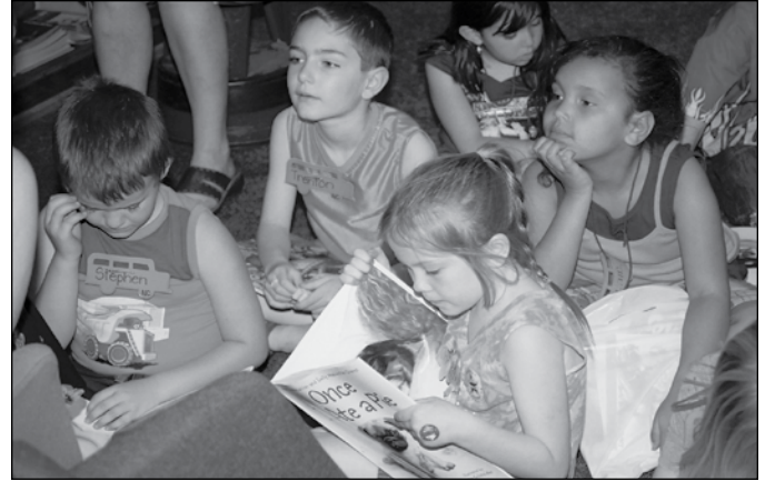
Students listen and read along with a celebrity reader during the 2009 Wyoming Reads celebration.

Just as those first graders grew from reading "Chicka Chicka Boom Boom" into reading classics like "To Kill a Mockingbird," Casper Cares, Casper Reads has grown into a statewide celebration, now reaching nearly 7,500 first