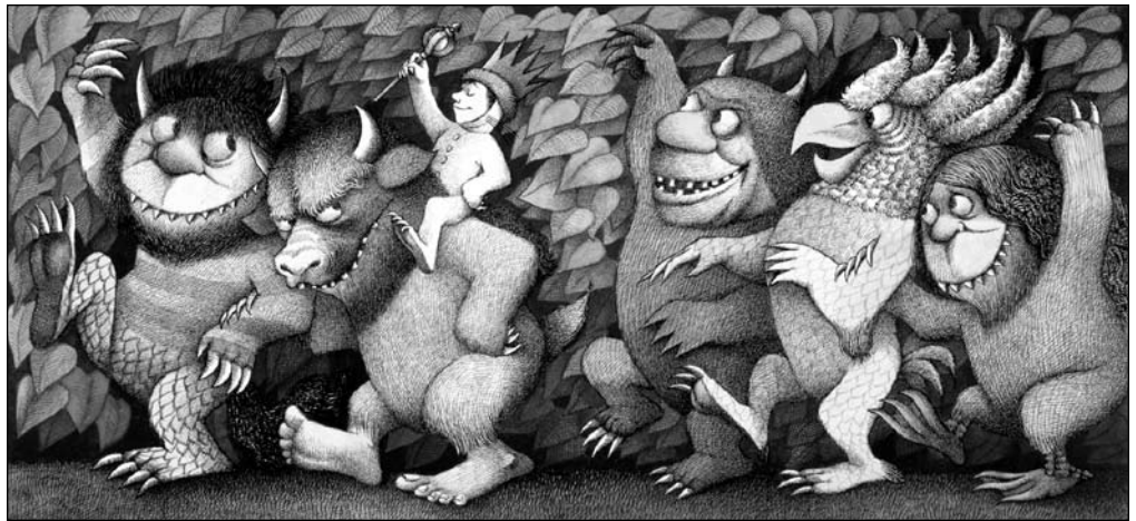
Final drawing for Where the Wild Things Are , © 1963 by Maurice Sendak, all rights reserved.

A new traveling exhibit will be on display at NCPL between August 31 and October 21. It will feature the work of popular children's author and illustrator Maurice Sendak. This colorful exhibit reveals key insights into Sendak's mind and glimpses of his varied artistic styles.