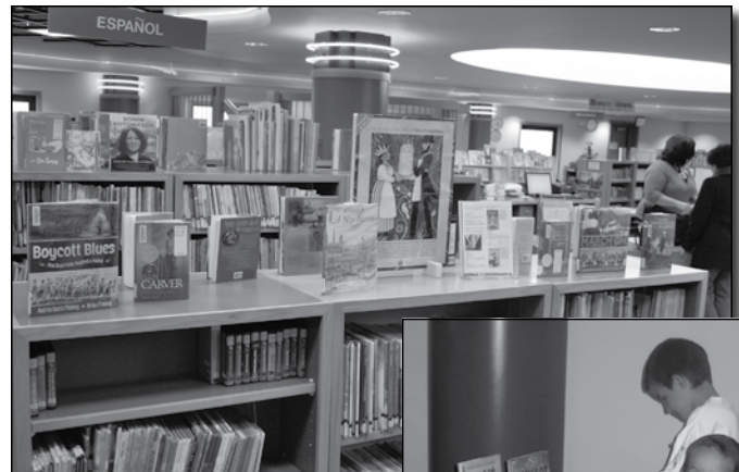
The NCPL building is out of room. One area in which this is particularly noticeable is in the children's department. As such, in August, about one-third of the books will be moved to the second floor of the main library. All non-fiction books, both children's and adult works will then be found on the second floor.